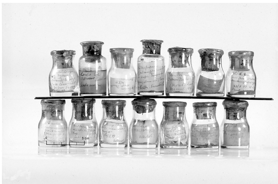
Fig. 2. Some of Fülleborn's samples from Lake Nyassa and surrounding waters of 1897–1900.

December 1897 and February 1900 either by Friedrich Fülleborn, a medical doctor stationed at the town Langenburg at Lake Nyassa, or Walther Goetze, a young botanist sent out by Engler to collect plants, and who he died on the expedition (Goetze 1899, Engler 1899, 1902). Almost all of Fülleborn's samples are extant whereas several of Goetze's are missing. This part of the collection comprises 91 samples (for some of Fülleborn's jars, see Fig. 2).