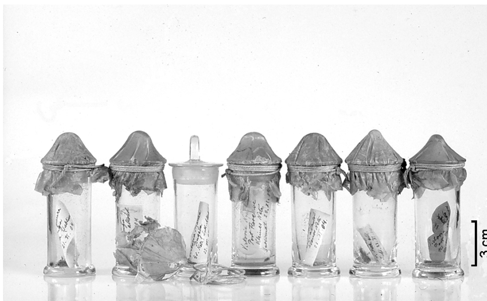
Fig. 3. Borgert's samples from Lake Victoria of 1904.

Müller's detailed list of examined samples (1904: 10–13), and Klee & Casper's statement (1992) that Müller's samples are missing, made it possible to recognize the identity as well as the value of these samples.