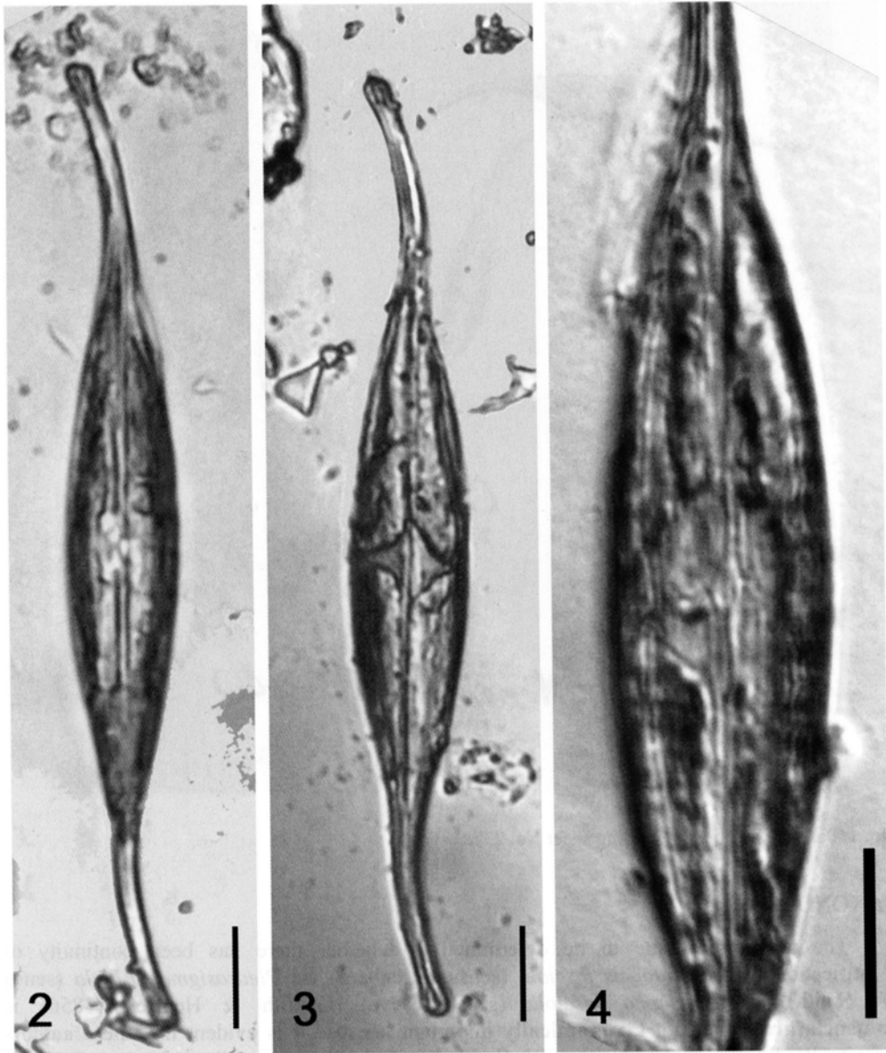
Figs 2–4. Gyrosigma fasciola . Ehrenberg's Taxonomic Preparations. Fig. 2. Cell on preparation No. 540032–4 (Lectotype) at centre of red ring. Fig. 3. Cell on preparation No. 540032–4 at the margin of red ring showing remnants of chloroplasts. Fig. 4. Specimen from original material (preparation No. 540032–3). Detail of the valve showing barely visible striation. Scale bar = 10 \mu m.